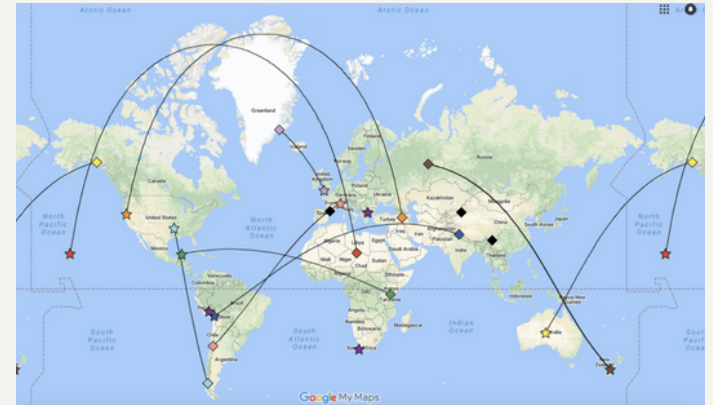
These are some of the main sacred portals around the world and their connections.

These places have great buildings and much wisdom anchored through their journeys and Eras of humanity. They are connected to the Earth's Cosmic Grid and maintain the planet's frequency and consciousness as we preserve its history, rituals and wisdom.